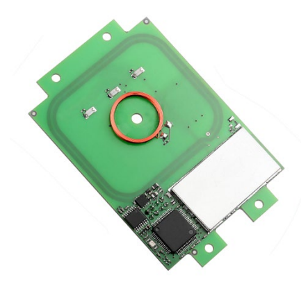
TWN4 MultiTech 2 LEGIC M PCB top view (exemplary)

MULTI-FREQUENCY RFID MODULE FOR LF, HF, NFC AND BLE