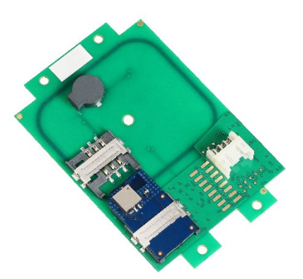
TWN4 MultiTech 2 LEGIC M PCB bottom view (exemplary)

The contactless RFID readers and modules of the ELATEC TWN4 MultiTech 2 LEGIC family are a direct enhancement of the TWN4 MultiTech LEGIC readers with the same form factors (PCB modules and desktop readers with housing). During the development of the TWN4 MultiTech 2 LEGIC family, special emphasis has been placed on optimizing the HF performance (13.56 MHz). Compared to the predecessor TWN4 MultiTech LEGIC, the read range could be increased by more than 50% for LEGIC transponders and even doubled for some HF transponders.