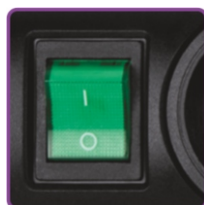
Bipolar, highlighted switch Ability to disconnect all stand-by mode devices (energy saving)