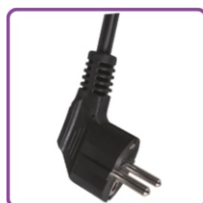
Plug with ground terminal