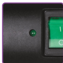
Surge protector indicator