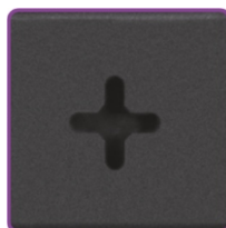
Holes for wall-mounting.

NOTE: Installation template available in the user manual.