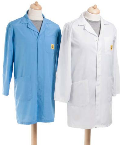
STC120x in blue