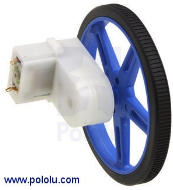
Mini plastic gearmotor offset 3mm D-shaft output with Pololu wheel.

This gearmotor features a 3 mm D-shaped output shaft that matches those on our micro metal gearmotors and works with the Pololu wheels and 3mm universal aluminum mounting hub: