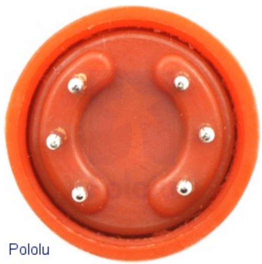
Gas sensor with orange plastic case bottom view.

This Carbon Monoxide (CO) and flammable gas sensor detects the concentrations of CO and combustible gas in the air and ouputs its reading as an analog voltage. The sensor can measure concentrations of CO from 10 to 1,000 ppm and flammable gas from 100 to 10,000 ppm. The sensor can operate at temperatures from -10 to 50°C and consumes less than 150 mA at 5 V. Please read the MQ9 datasheet (180k pdf) for more information about the sensor.