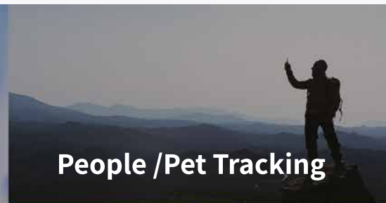
People /Pet Tracking