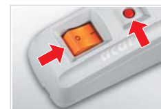
ILLUMINATED DOUBLE POLE MAINS SWITCH AND SLOW-BLOW AUTOMATIC FUSE