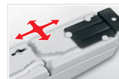
4 POSSIBLE DIRECTIONS OF ARRANGEMENT OF THE POWER CABLE

The manufacturer reserves the right to change the technical parameters of the device, resulting from technological progress. ATTENTION! The technical data define the maximum values of surges against which the device protects.