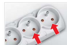
5 SOCKETS 10A WITH EARTHING PIN AND SAFETY SHUTTERS