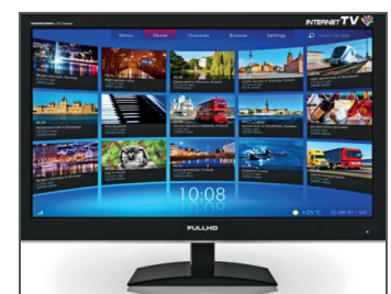
Wireless Internet TV