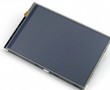
4inch RPi LCD (A) 320×480, IPS

4 inch Touch Screen TFT LCD Designed for Raspberry Pi